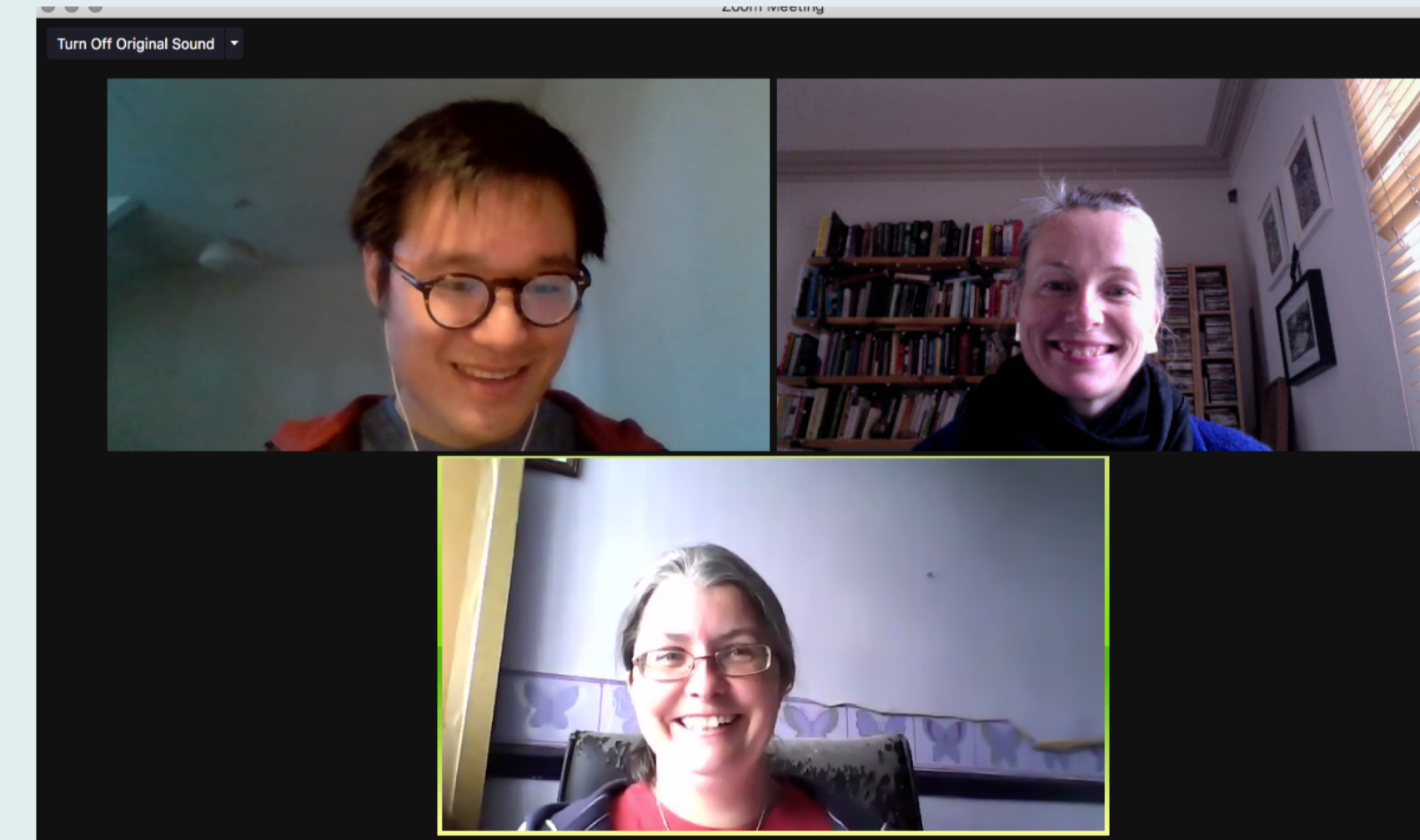
In the Zoom Room